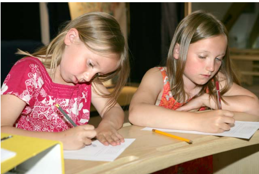
Children doing an activity in the Artist's Attic

"The activities were exciting and well thought-out – full of good ideas for teachers too! We'll definitely be recommending Seven Stories!" Coulson Park First School