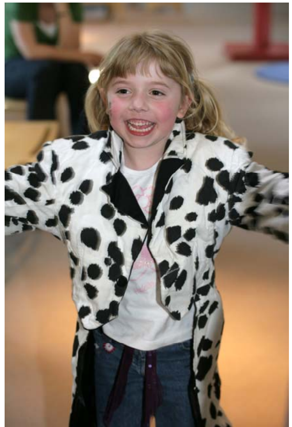
Child sampling our dressing up collection!

"A veritable enrichment experience!" Linda Mullen, Ivy Road Primary