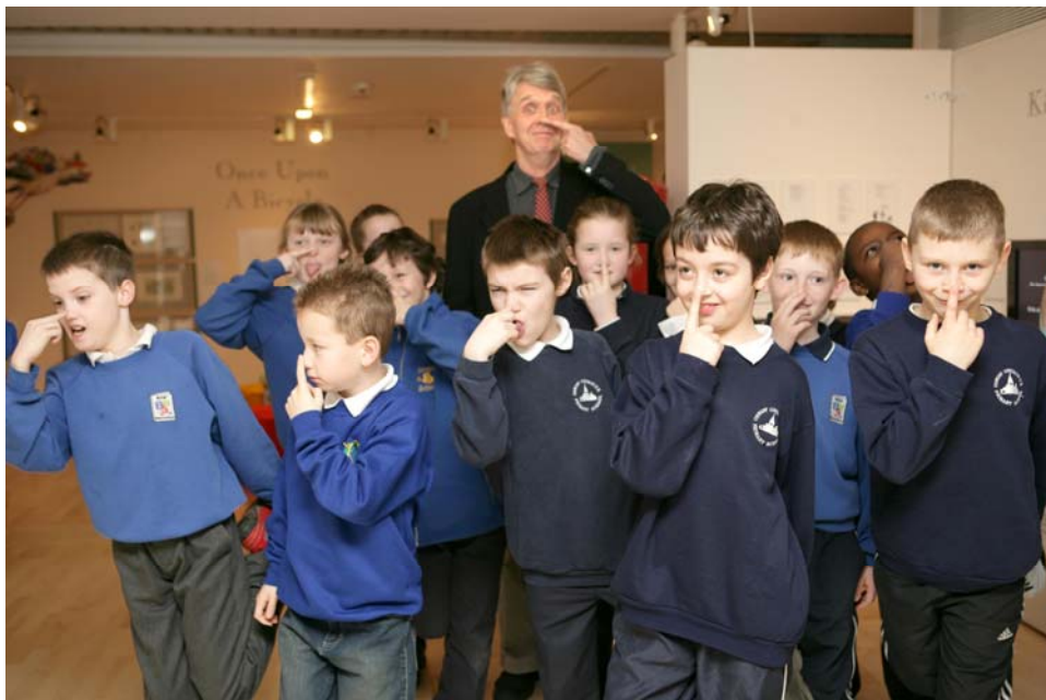
Children from Byker Primary with author Allan Ahlberg