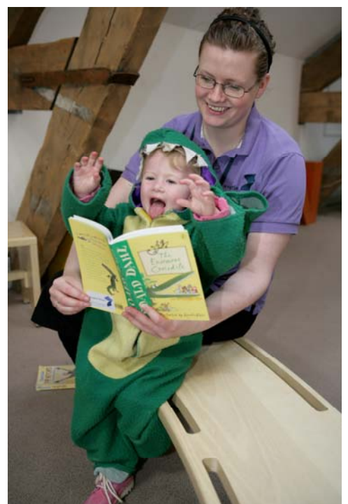
Child with Seven Stories staff member in the Artist's Attic

A school or group visit to Seven Stories costs £3.50 per child with 2 FREE adult places for every 10 children.