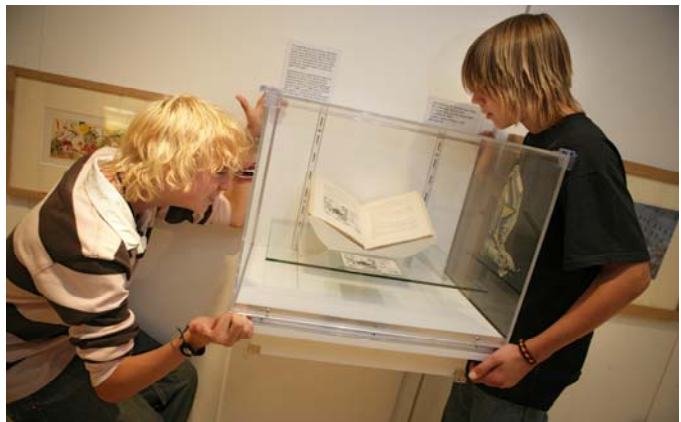
Pupils from Heaton Manor exploring gallery