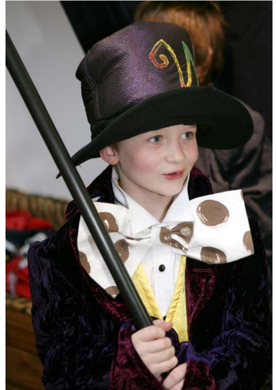
Child dressed up as Willy Wonka