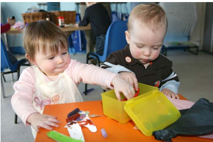
Children doing an activity in the Engine Room