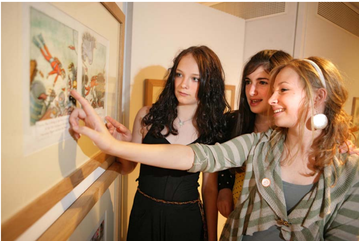
Pupils from Heaton Manor exploring the gallery

The option to add on a one hour hands-on session for your KS4, 16+ or Adult group. Your group will have an introductory talk and time to explore Seven Stories, with a chance to participate in a facilitated session with a member of Seven Stories' staff. Sessions will focus on either our collection or a creative activity that 'lets out your inner child'!