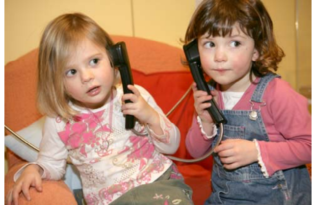
Children in Bear Hunt gallery